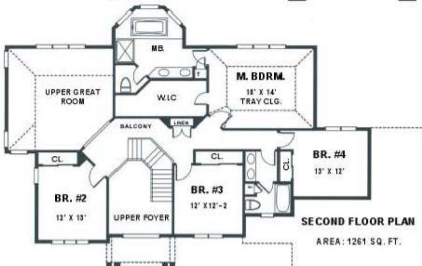
SECOND FLOOR PLAN AREA: 1261 SQ. FT.