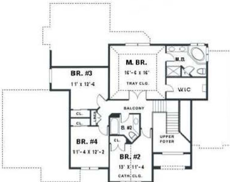
SECOND FLOOR AREA: 1143 SQ. FT.