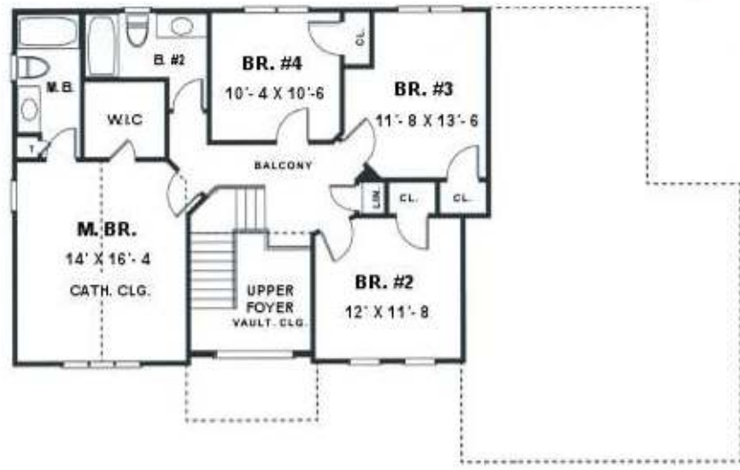
SECOND FLOOR AREA: 921 SQ. FT.